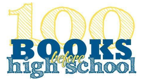
Reading reward program for independent readers Kindergarten through 8th grade.

The only deadline for this program is when a child starts kindergarten. Let the RML help you get a jump-start on your child's success in school. Stop in often to check out books and get great reading suggestions.