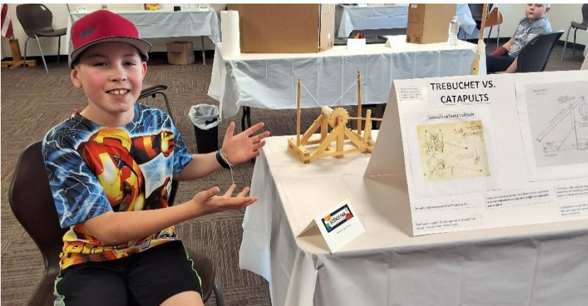
Homeschool Science Fair 2026