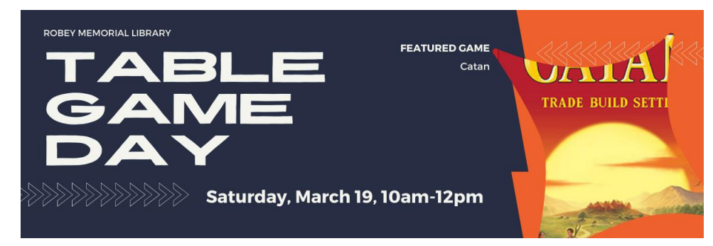
Table Game Day

RML is hosting a table game event on March 19 with games suitable for the whole family.