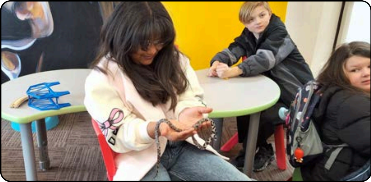
Afternoon with the Driftless: Snakes!