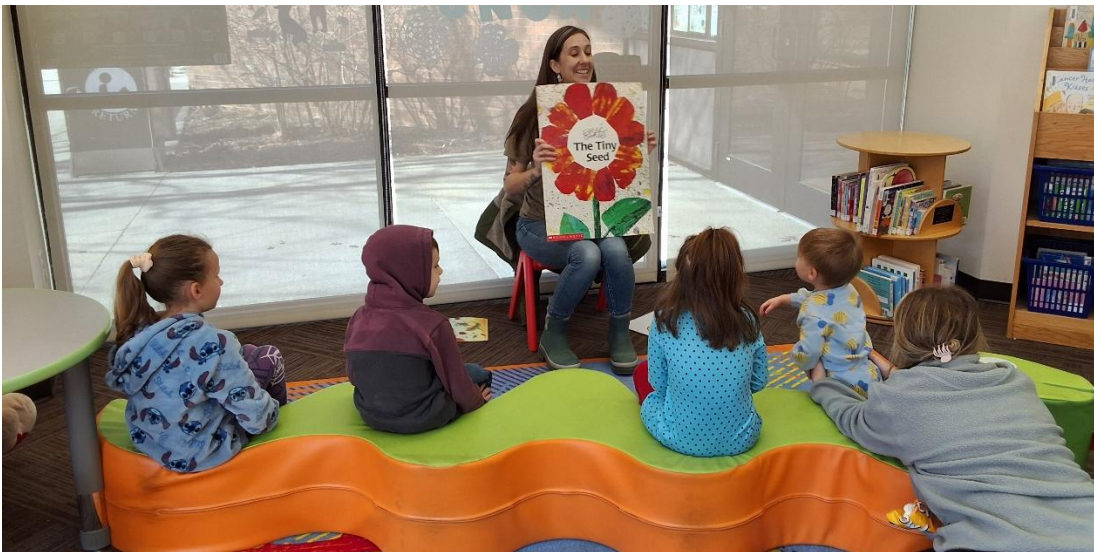
Story Time with the Driftless